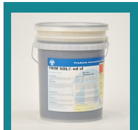
5-gallon pail SKU: SOLNDSF/5 UPC-12: 641238008811