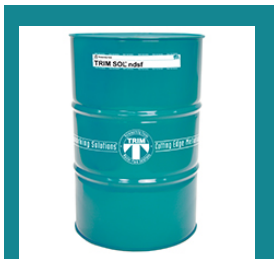
54-gallon drum SKU: SOLNDSF/54 UPC-12: 641238008828