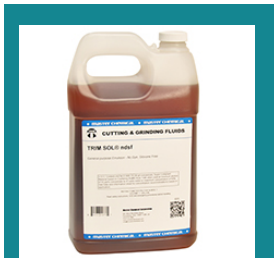
1-gallon jug SKU: SOLNDSF/1 UPC-12: 641238008781