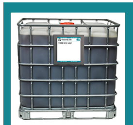
270-gallon tote SKU: SOLNDSF/NR270P UPC-12: 641238034247